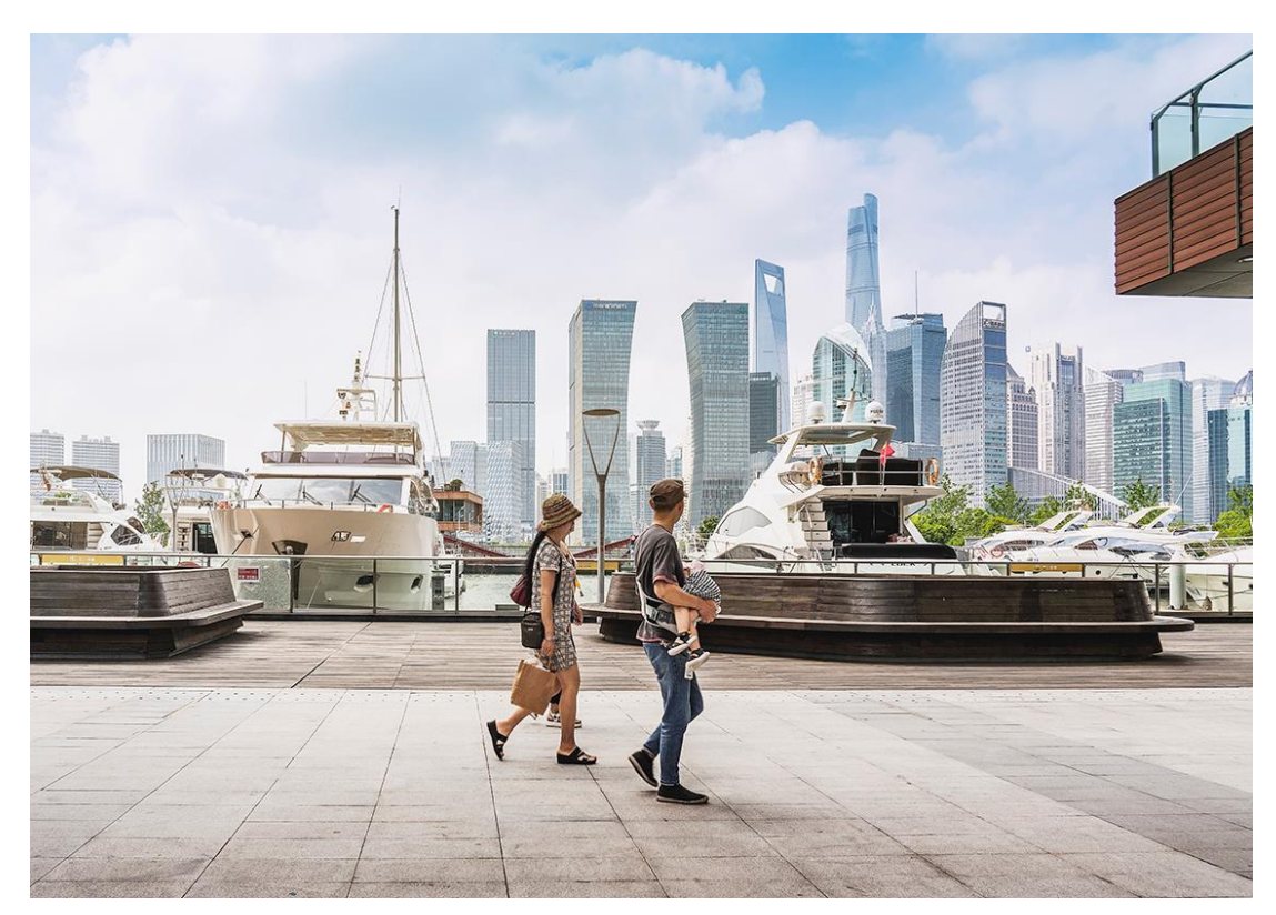
Inner harbor pier