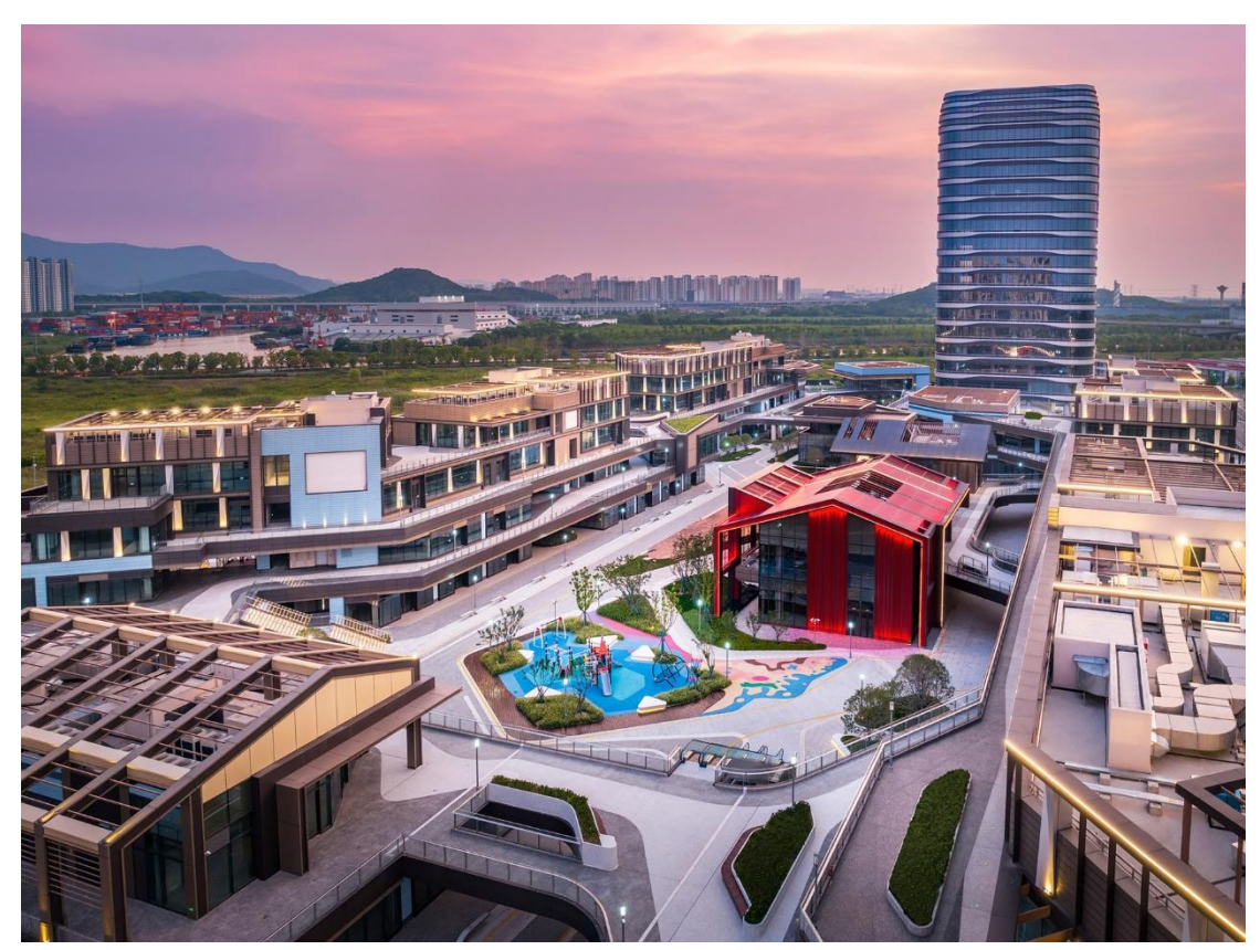
Overall view of shopping park

Refining the elements of landscape with concise design techniques to evoke people's associations with nature. The rhythmic pavement design symbolizes the water flow fluctuations. In addition, the bright-color building in the central area emphasizes the sense of aggregation in the commercial district.