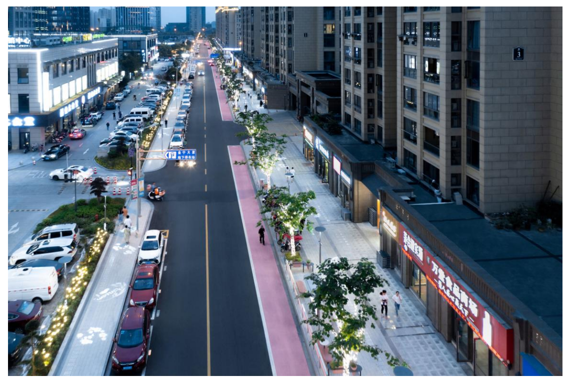
Overall View of the Fuye Street

Fuye Street is the most important commercial street in Zhenhai District, Ningbo. The issue of Fuye Street is common in China. For example, the traffic is out of order, including the randomness of parking, the unfriendly pedestrian space, the unaesthetic street furniture, and the illegal occupation of commercial space causing the lack of popularity in Fuye Street.