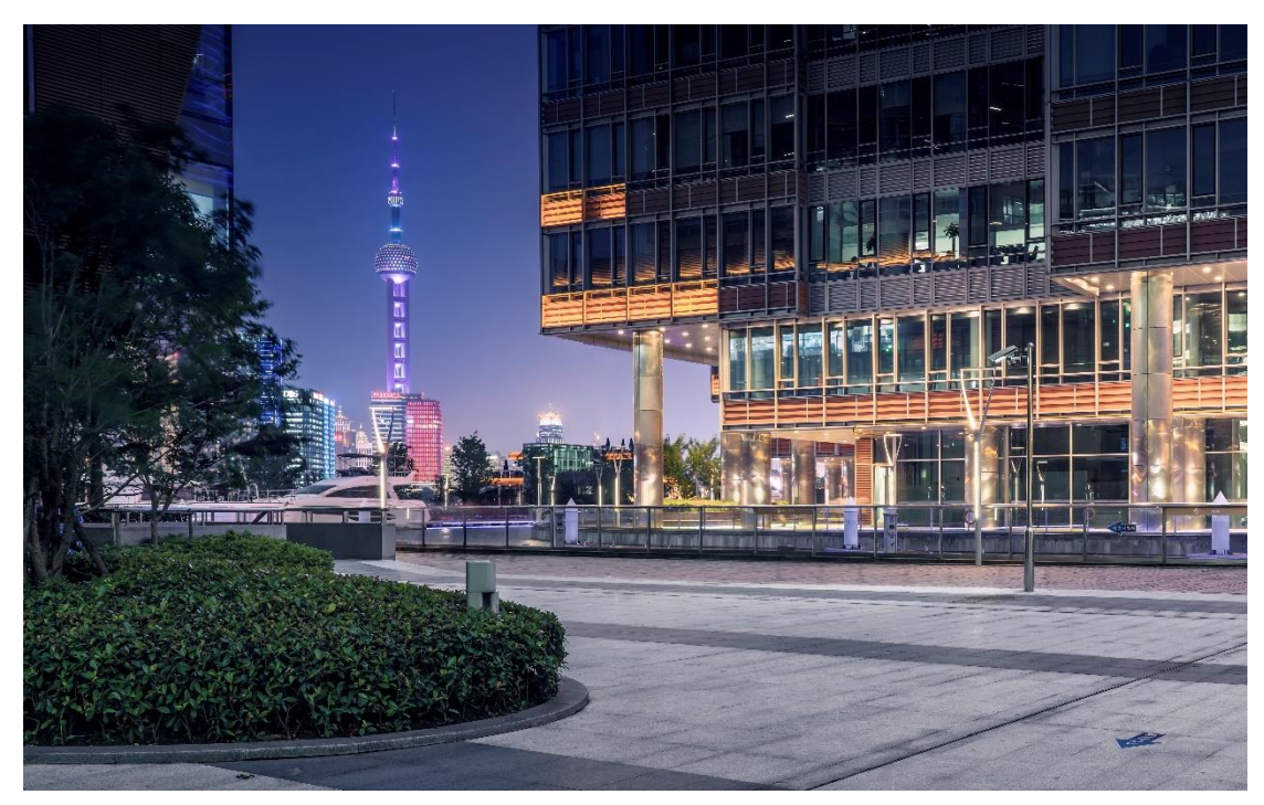
Enjoy the Oriental Pearl at night

River viewing terraces are designed in different heights, enriching people's river viewing experience, creating an urban waterfront lifestyle.