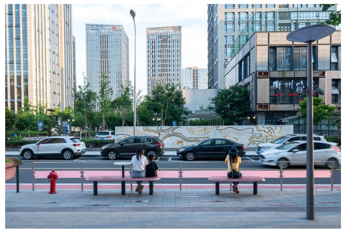
3D printing art wall

In terms of the rich historical and cultural characteristics of Ningbo, MYP team proposed to use advanced technical ways to realize the representation of water town. 3D printing art wall shows the hundred years history of the prosperity and development of Ningbo in a 15-meter hyperbolic scroll, which is currently the largest outdoor 3D printed art wall in China.