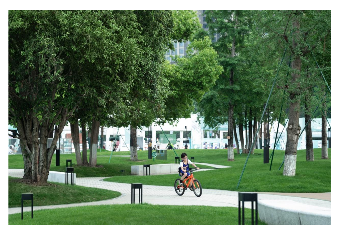
Daily leisure activities in the Kowloon Bund Park