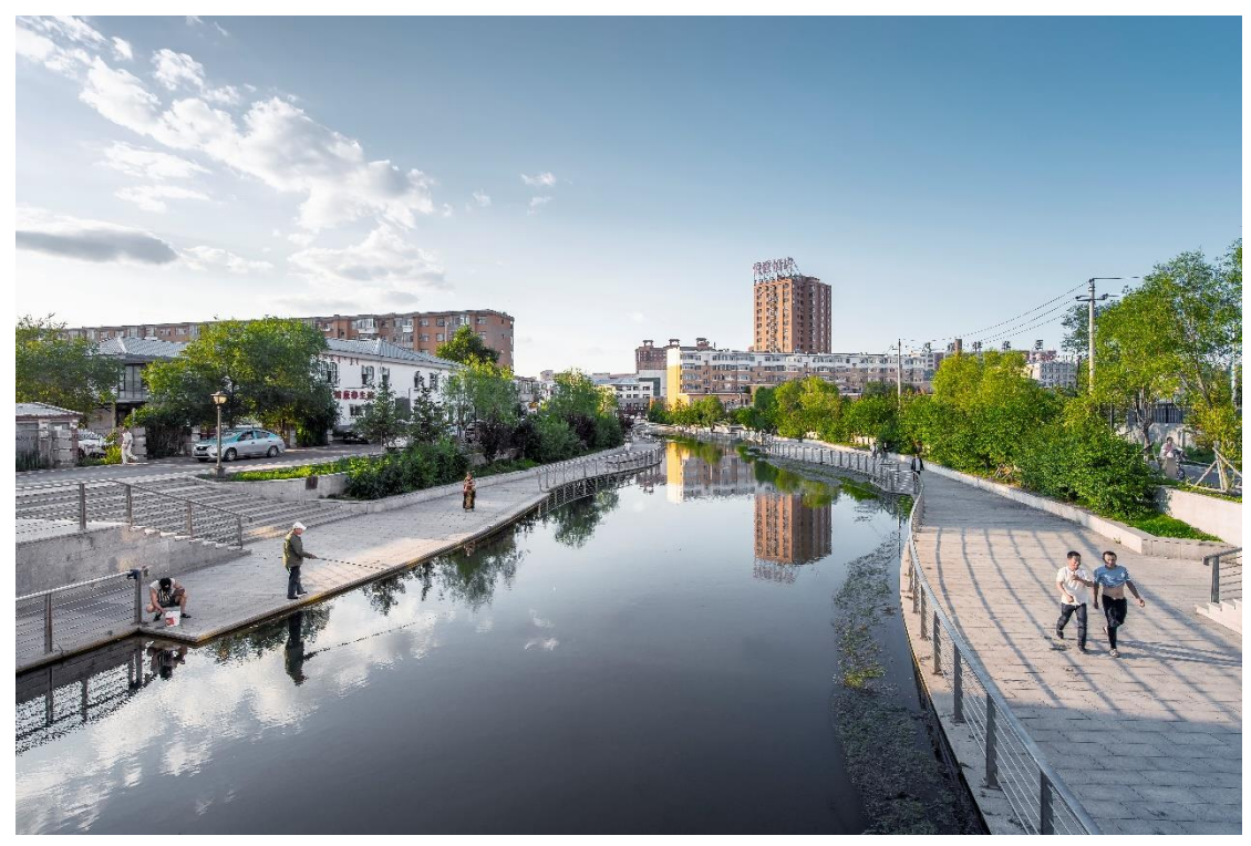
Activate community riverside

and sightseeing needs. The park utilizes local plants to form a seasonal landscape. The cultural square and sightseeing platforms are used as landmark, which offer a taste of local ethnic culture.