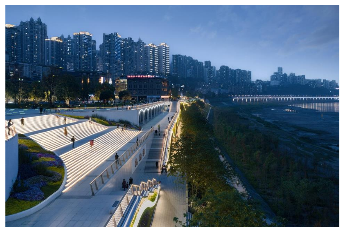
River viewing platforms at different elevations

To accommodate the riverbank's everchanging water levels and the ecological fragility of its fluctuation zone, MYP team emphasizes "seasonal usage" as the project's core concept and implements a multi-dimensional public space system.