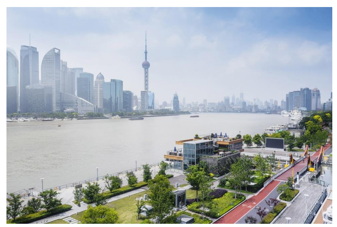
The best view of Lujiazui

The North Bund was completed on July 2017. Building the 3-Slow System is important for the Hongkou District waterfront. People can walk, ride bikes and jog on 2.5km promenade, creating a healthier lifestyle along the Huangpu waterfront.