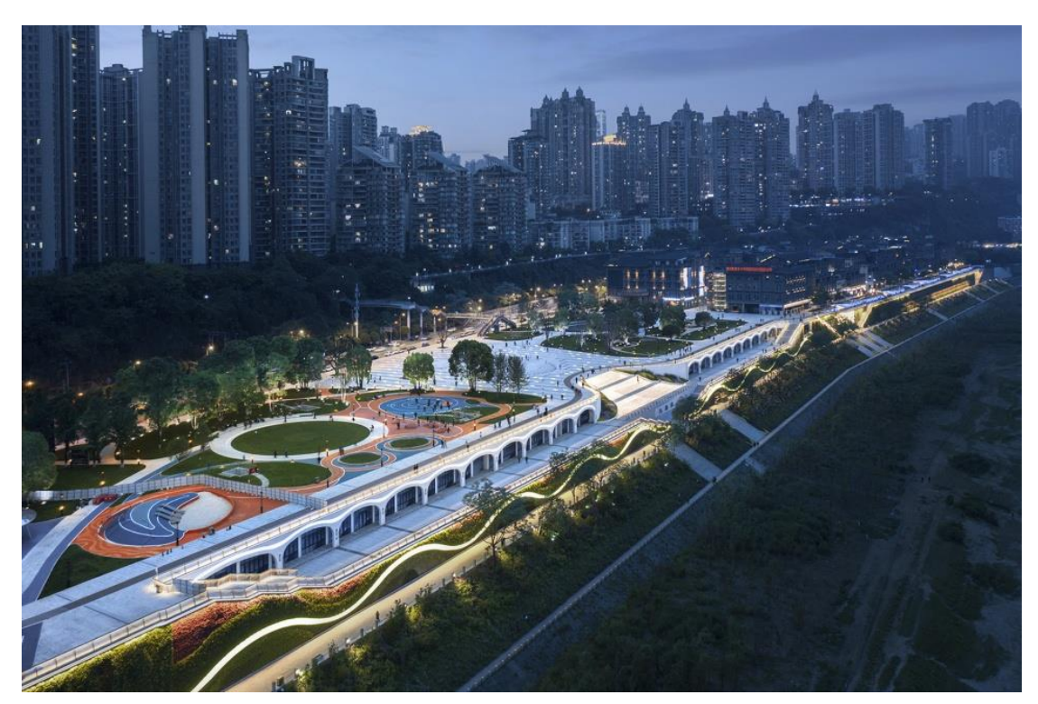
Overall view of the Kowloon Bund

To accommodate the riverbank's everchanging water levels and the ecological fragility of its fluctuation zone, MYP team emphasizes "seasonal usage" as the project's core concept and implements a multi-dimensional public space system.