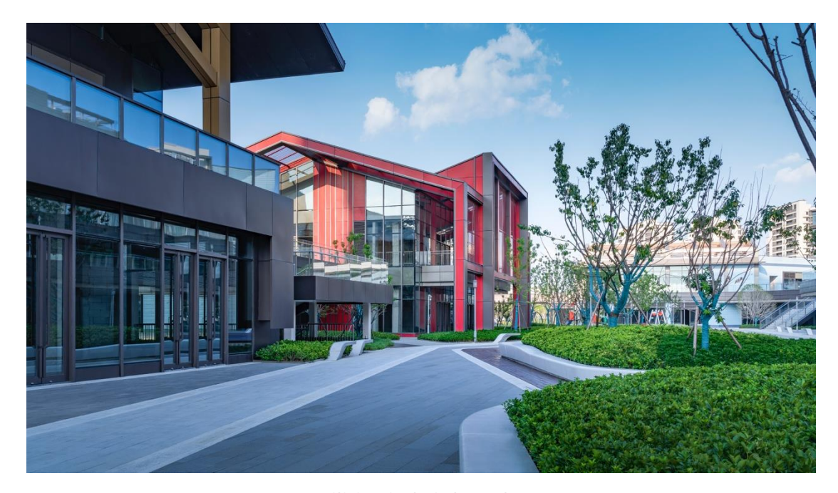
Facilities in bright colours

For latest updates on projects, please visit our website <a href="http://www.officemyp.com/">http://www.officemyp.com/</a>