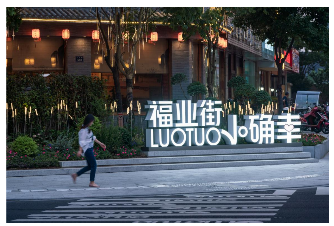
"Fuye Street Little Fortune" theme LOGO

MYP team is committed to creating a happy street for citizens' lives and a place for leisure. Firstly, rearranged the existing traffic order to provide a friendly pedestrian space. Then, used pink as the main color in the street, including the creative pink series for bicycle lanes, benches, billboards, and the selection of grass and flowers.