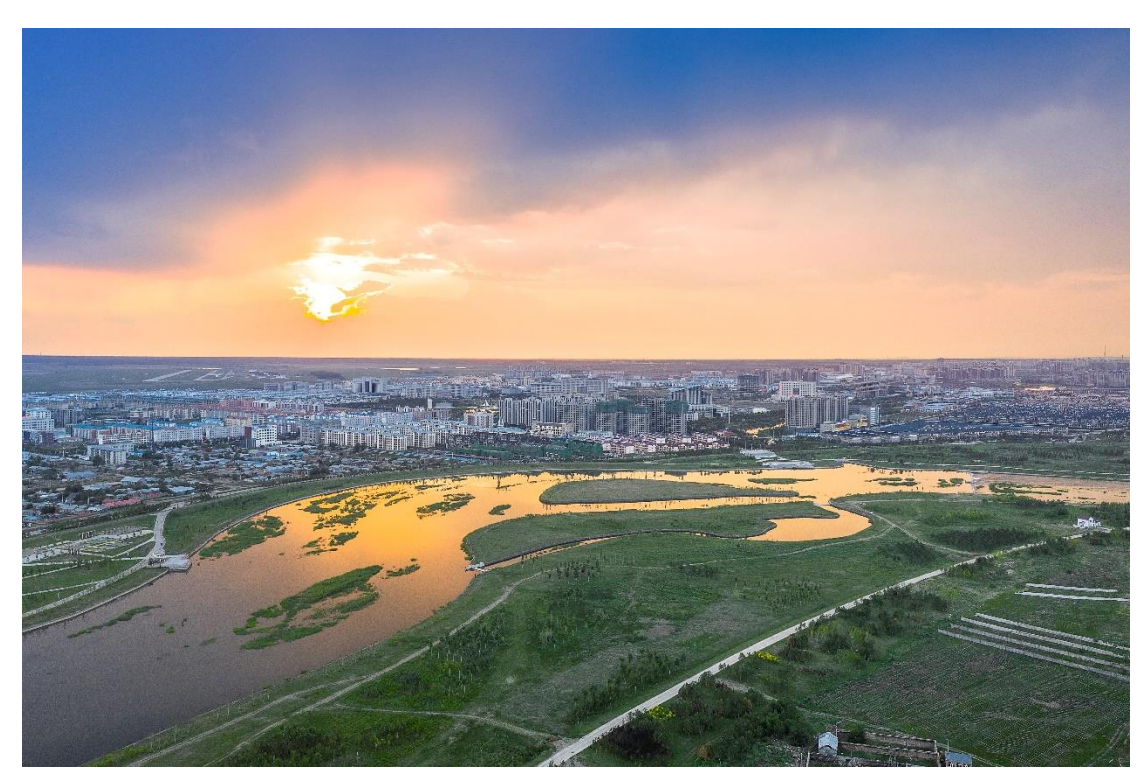
Overall view of the Yimin River

With rapid urban development, the river's original ecosystem has been harmed severely. MYP team implemented a systematic restoration of the water system, which reduce the effects of flooding, also support bird habitats and provide sport fishing area.