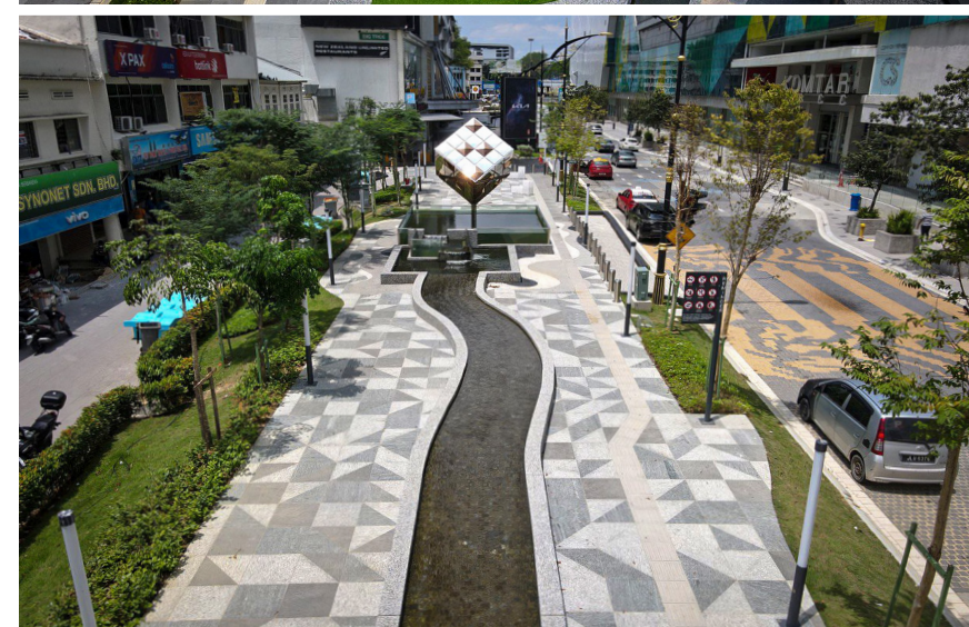
PHOTO (FROM TOP TP BOTTOM) The development of Sungai Segget highlights different landscape concepts such as the Zone 1: Historical and Heritage; Zone 2: Cultural and Arts as well as Zone 3: Fun and I eisure zone.